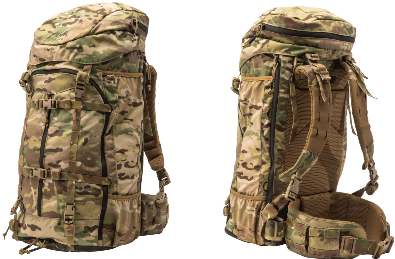
EXPANDABLE TACTICAL ALL TERRAIN PACK