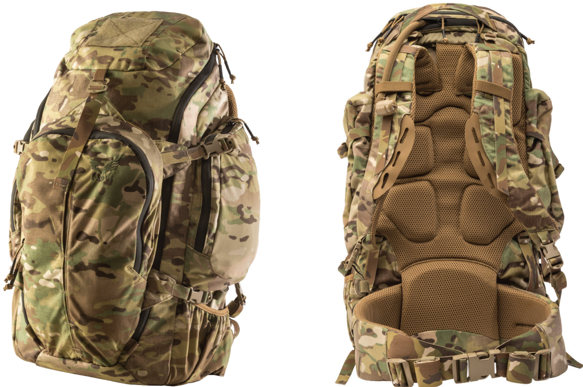
50 LITER MULTI-PURPOSE TACTICAL ASSAULT PACK