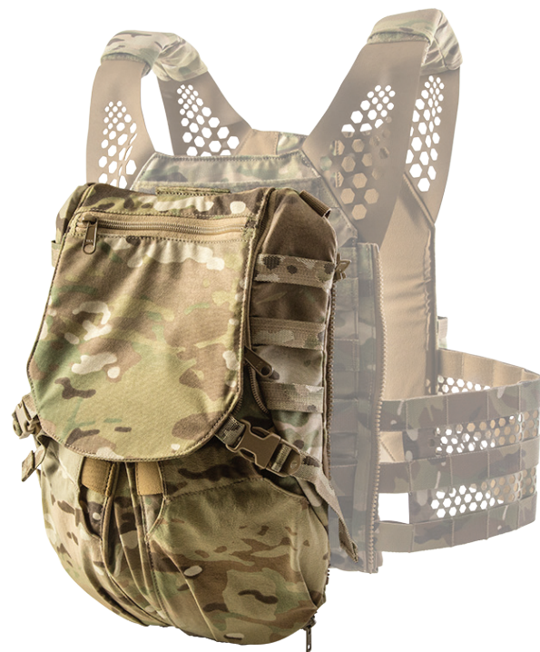
LOW PROFILE, ADAPTABLE ASSAULT PACK