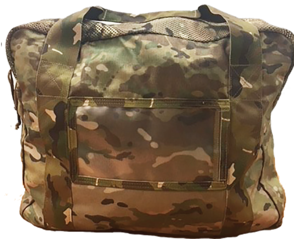
MULTI-PURPOSE BAG WITH VENTILATION MADE TO HOLD VESTS AND ALL OTHER NECESSARY EQUIPMENT