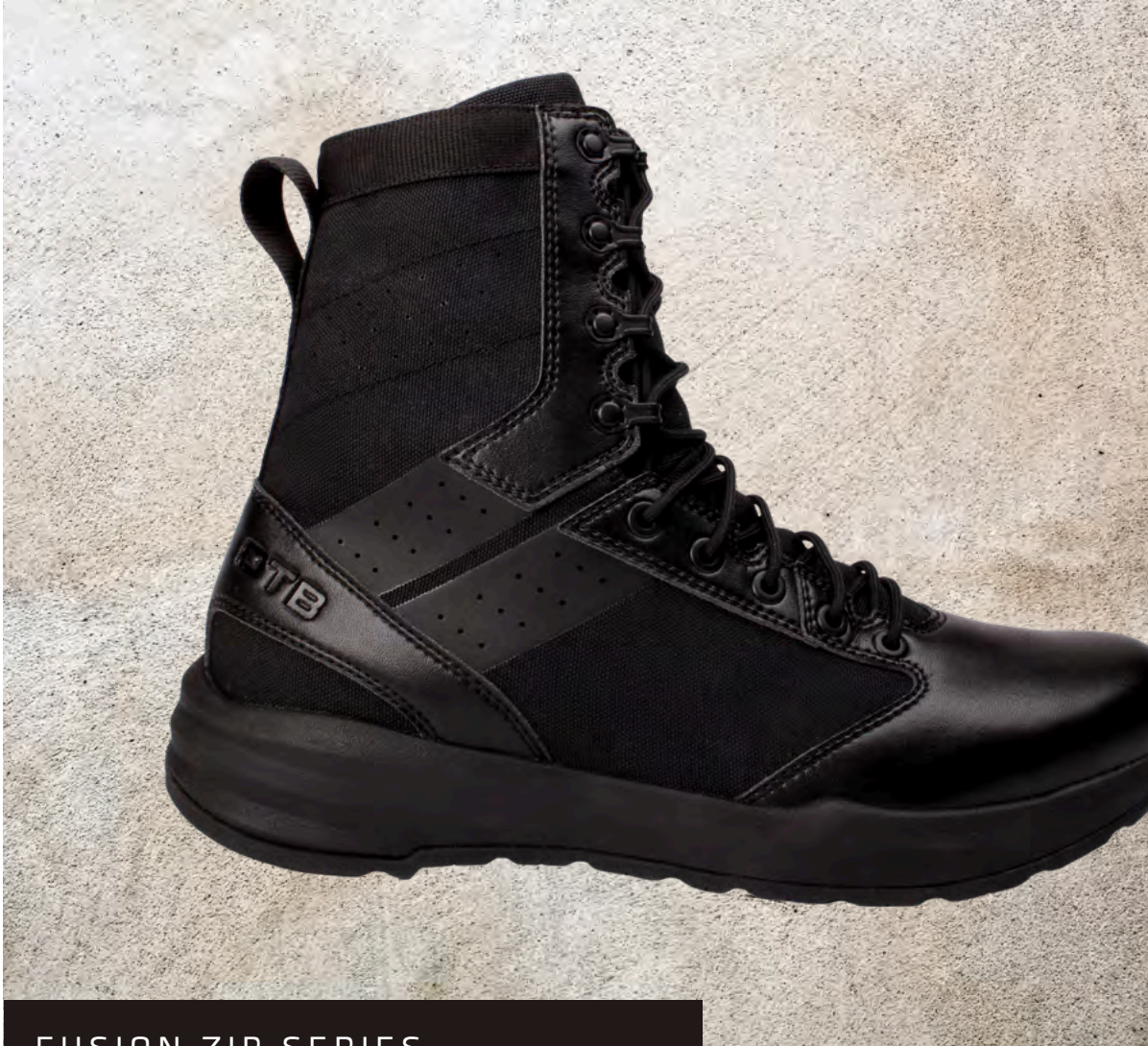
FUSION ZIP SERIES