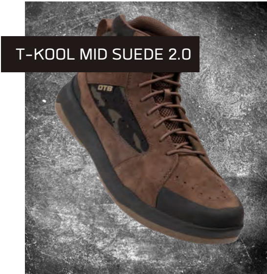
T-KOOL MID SUEDE 2.0

Rides like a running shoe with the support and durability of a tactical boot. Now with improved 2.0 outsole.