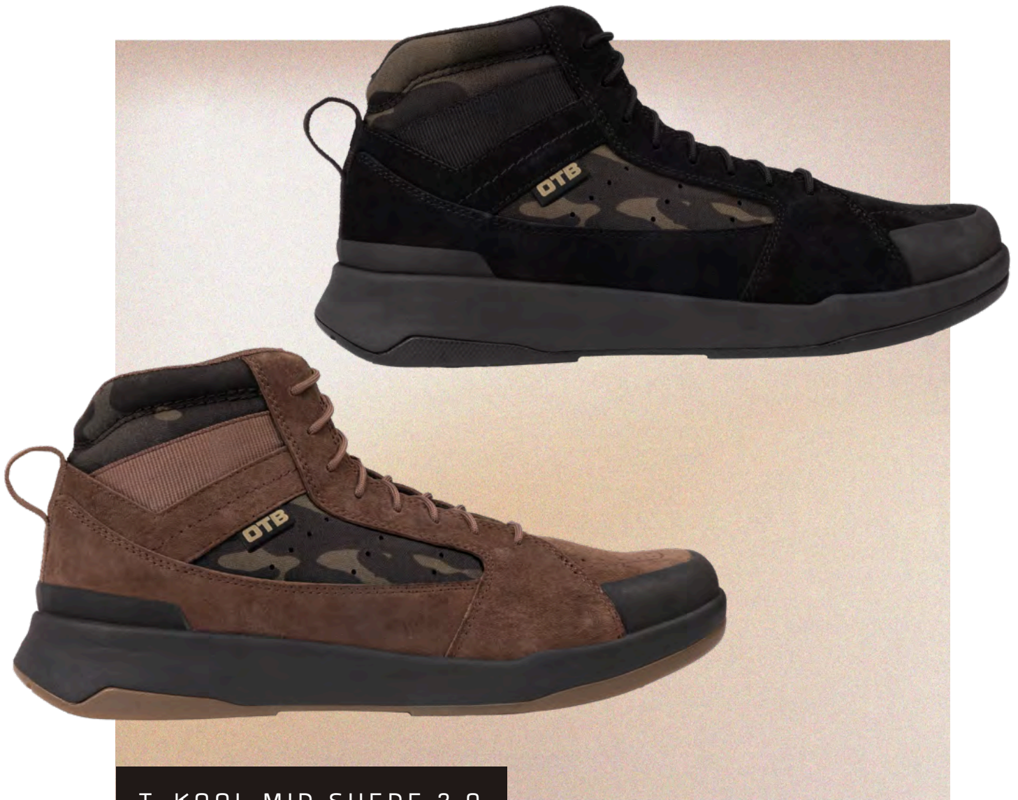
T-KOOL MID SUEDE 2.0